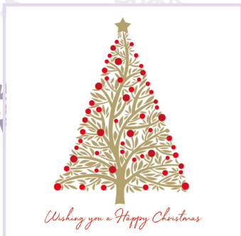
J: Christmas Tree £4.00 (15cm x 15cm)