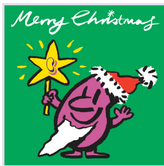
O: KFL Crimbo (single card) £1.00 (15cm x 15cm)