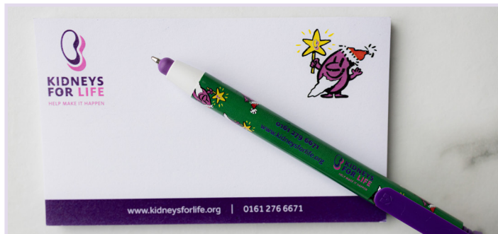
S: Our Xmas Kid Post-it Notes and Our Kid Pen