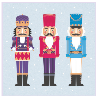
M: Nutcracker Trio £3.95 (14cm x 14cm)