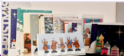
R: 20 Card Bundle Pack £5.00 (varying sizes) All previously sold by KFL

To order: Complete the order form Call: 0161 276 6671 Email: fundraiser@kidneysforlife.org Website: https://kidneysforlife.org