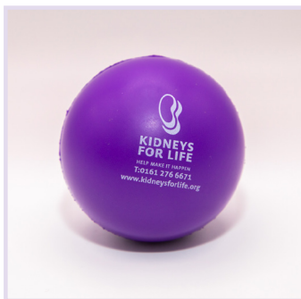
Y: Stress Ball

Great for dialysis patients and for anyone who gets stressed at Christmas.