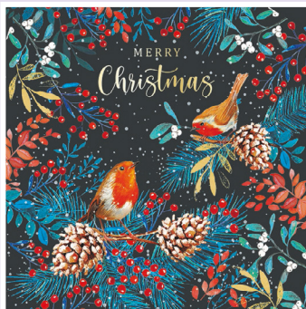
B: Winter Floral Robins £3.95 (14cm x 14cm)