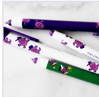
T: Our Kid Pen £1.00