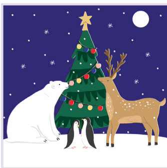
N: Moonlit Animals £1.50 (12cm x 12cm)