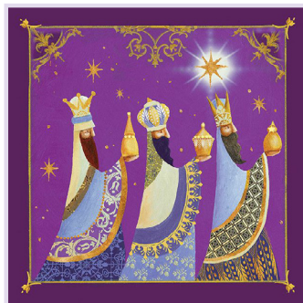
L: Purple Kings £2.00 (14cm x 14cm)