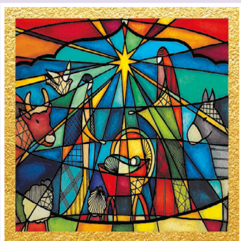
D: Stained Glass Nativity £3.95 (14cm x 14cm)