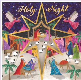
A: Starlit Nativity £3.95 (14cm x 14cm)