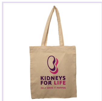
U: Our Kid Tote Bag

Show your support for Kidneys for Life by using one of our new cotton tote bags.