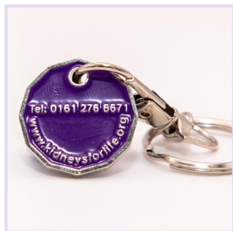
X: Trolley Token Keyring