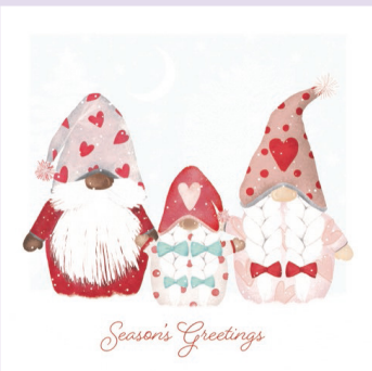
G: Gonk Family £3.50 (12.6cm x 12.6cm)