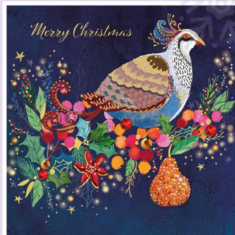
C: Colourful Partridge £3.95 (15cm x 15cm)