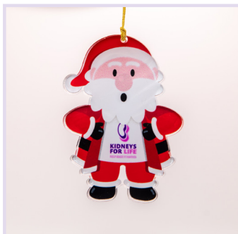
V: Santa Decoration

Our brilliant mascot now in keyring format.