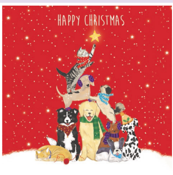
H: Reaching for the Stars £3.50 (12.6cm x 12.6cm)