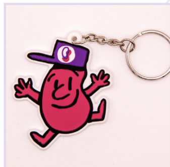
W: Our Kid Keyring

Our brilliant mascot now in keyring format.