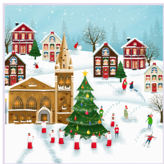
P: Church Scene £1.50 (12cm x 12cm)