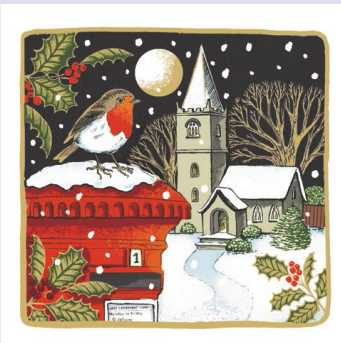
F: Moonlit Robin £3.95 (14cm x 14cm)