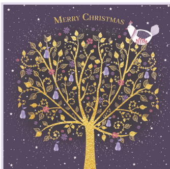
K: Partridge in a Pear Tree £3.95 (14cm x 14cm)