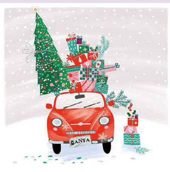
E: Travelling Light £3.95 (14cm x 14cm)