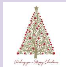
G: Christmas Tree £4.00 (15cm x 15cm)