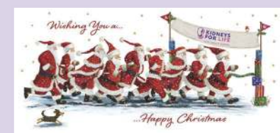
F: Kidneys For Life Santa Dash £4.00 (21cm x 10cm)