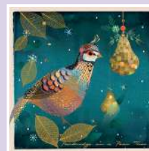
D: Teal Partridge £3.75 (14cm x 14cm)