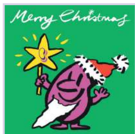
L: Kidneys for Life Crimbo £2.00 (15cm x 15cm) Designed especially for KFL by Cardinky