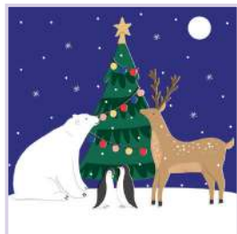
J: Moonlit Animals £2.50 (12.5cm x 12.5cm)