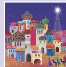
B: Approaching Bethlehem £3.75 (15cm x 15cm)