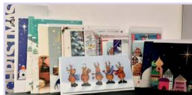
P: Bundle Pack - 20 Assorted Cards £5.00 (varying sizes) All previously sold by KFL