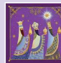
E: Purple Kings £3.75 (14cm x 14cm)