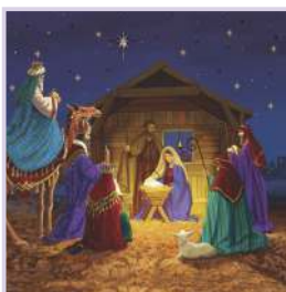
N: The Christmas Story £4.00 (16cm x 16cm) Gold foil and middle page