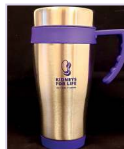
V: KFL Travel Mug £10.00 450ml double walled, stainless steel travel mug with PP plastic interior. The lid has a secure sliding sipper. BPA & PVC free.