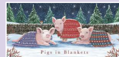
C: Pigs in Blankets £3.75 (21cm x 10cm)