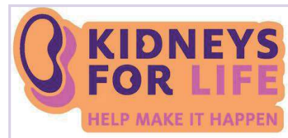
Q: Pin Badge Rose Gold £2.00