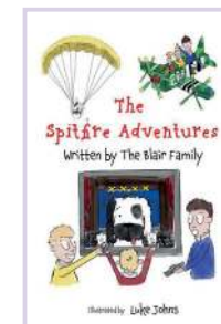
X: The Spitfire Adventures written by The Blair Family £10.95 – all profit from the book comes to KFL This fantastic paperback book with beautiful illustrations is the perfect way to encourage any younger members of the family to read – would make a great Xmas present!