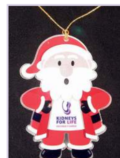
T: Santa KFL Christmas Decoration Limited Edition - £3.50