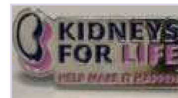
R: Pin Badge Silver £2.00