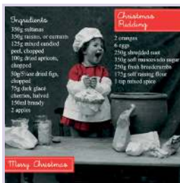
K: Little Girl Baking £ 1.00 (12.8cm x 12.8cm) Shiny finish includes actual sixpence