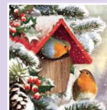
H: Christmas Duo £3.75 (14cm x 14cm)