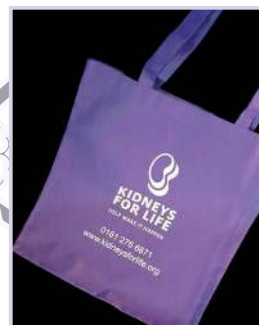
S: Kidneys for Life Tote Bag £2.00