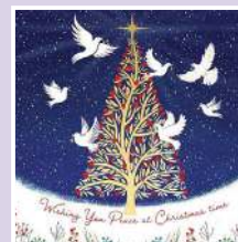
A: Christmas Tree Doves £4.00 (15cm x 15cm)