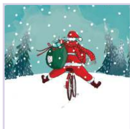
M: Santa Riding his Bike £2.00 (13.7cm x 13.7cm)