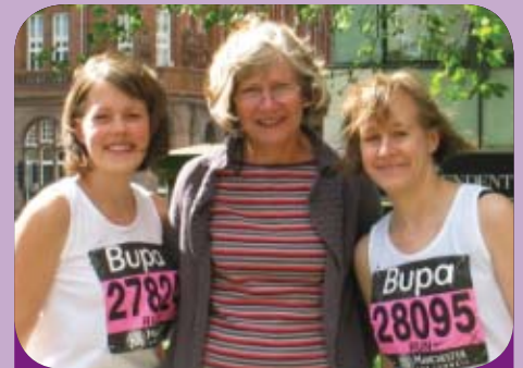
Pictured Left to Right