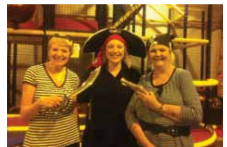
The Funtastic Team