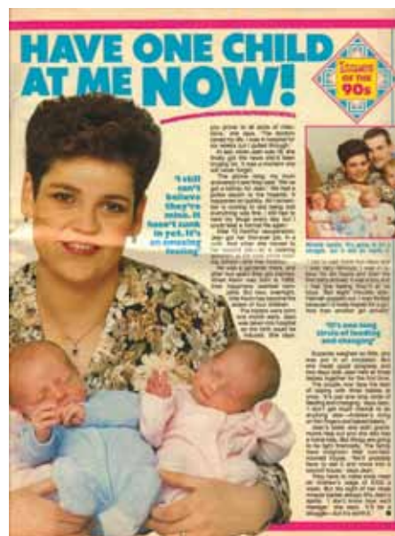
Woman Magazine, 1991

I need to take drugs for the rest of my life and attend the MRI for checkups on a regular basis, but this is nothing compared to having my life back.